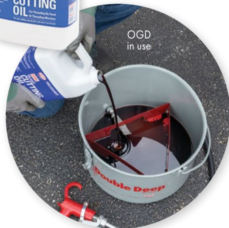
OGD in use

Higher lubricity for longer die life and faster cutting speed.