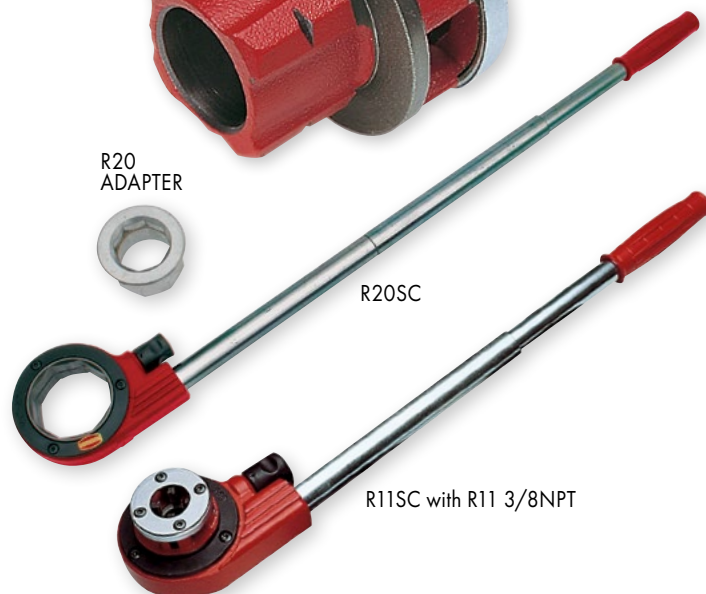
R11SC with R11 3/8NPT