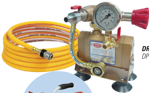
DRILL POWERED DPHTP500