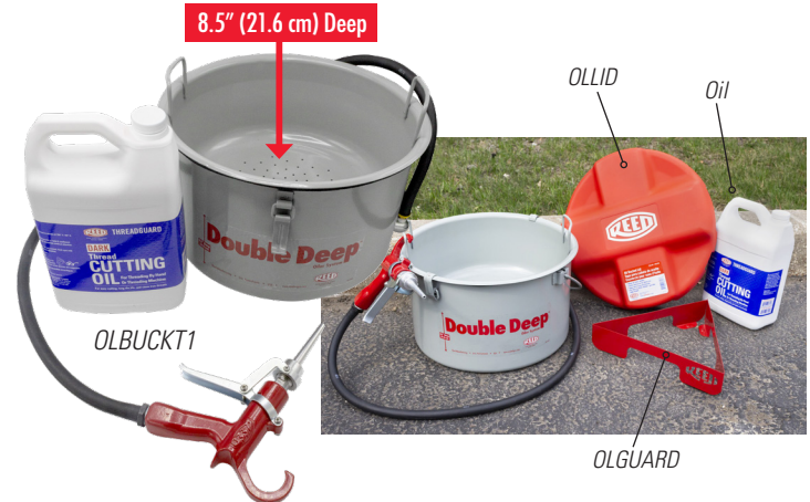
8.5" (21.6 cm) Deep