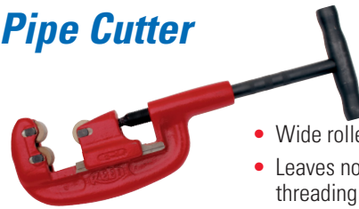
2-1 Pipe Cutter