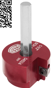
PPR150 - 04524 - 1½"