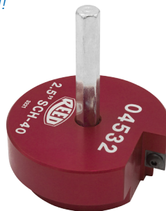
PPR250 - 04532 - 2½"