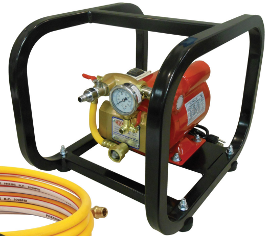
EHTP500C / EHTP500CE • with protective metal cage